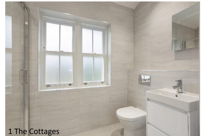
1 The Cottages