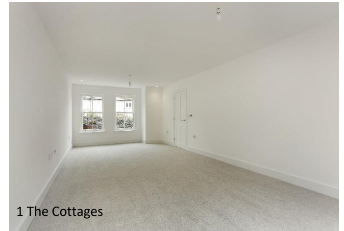
1 The Cottages