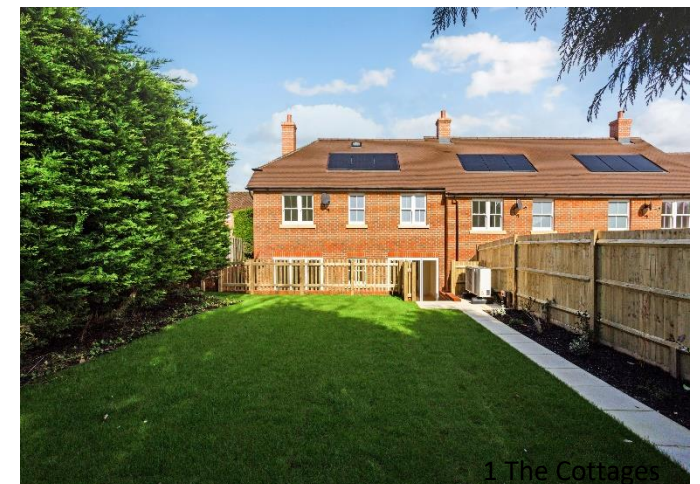
1 The Cottages