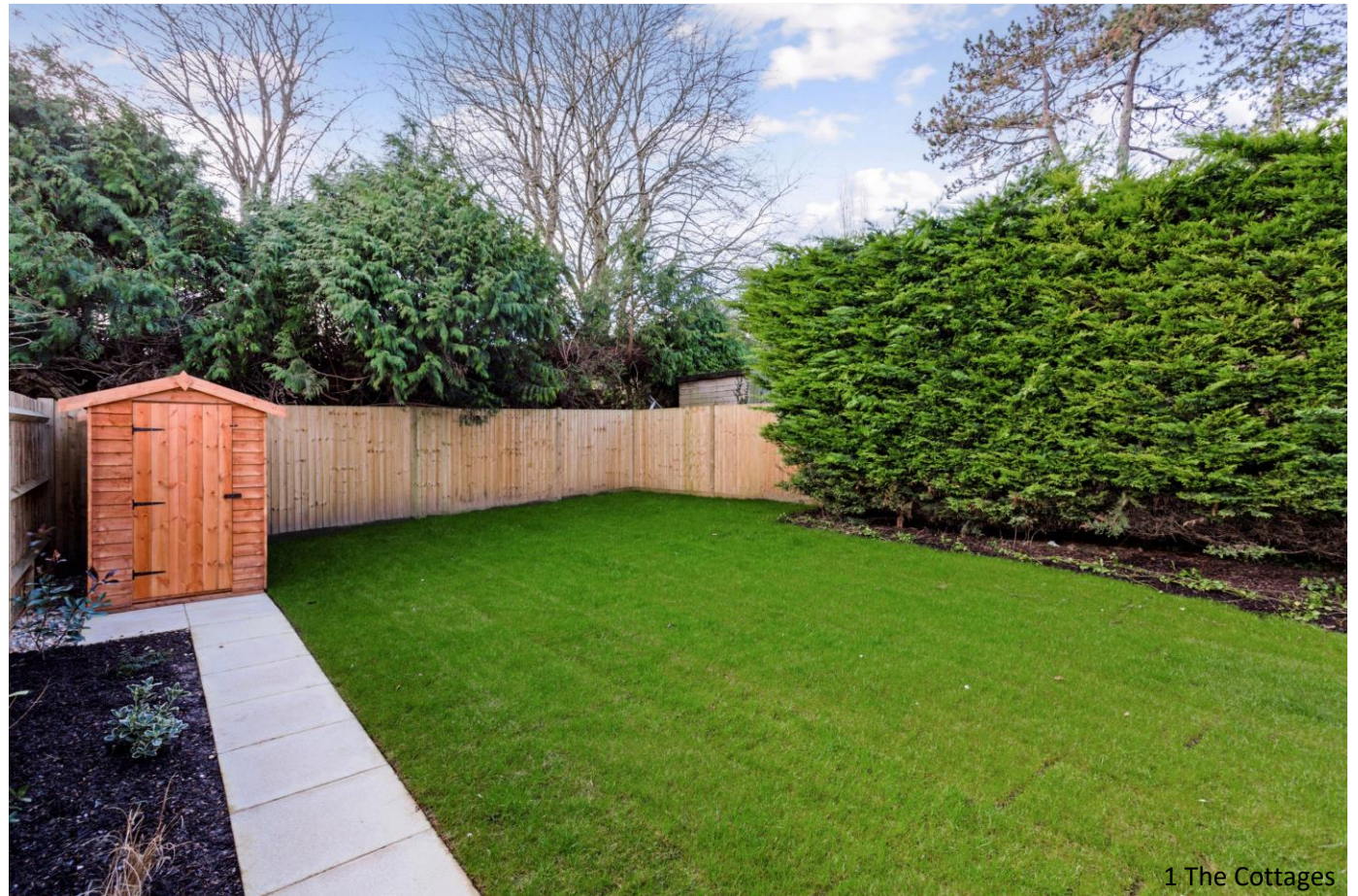
1 The Cottages

All viewings will be accompanied and are strictly by prior arrangement through Savills Winchester RDS. +44 (0) 1962 834 045