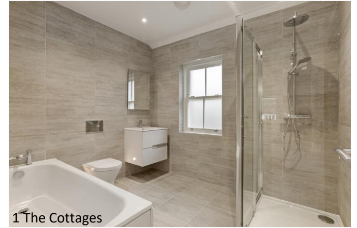
1 The Cottages