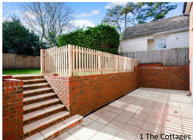
1 The Cottages